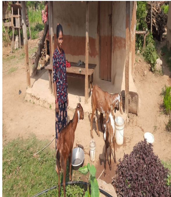
Ms. \dots is rearing goat to using the UNDP support